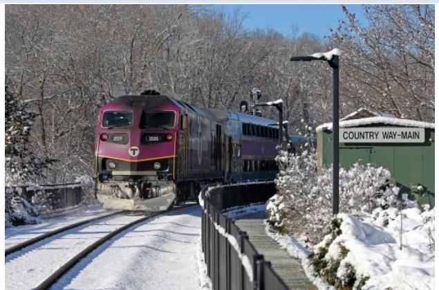
Scituate, MA – January 8: MBTA commuter rail train

Connecticut has some of the largest lot size requirements in the nation. Our neighbor Massachusetts has adopted smaller lot sizes in areas close to public transit to better influence Transit-Oriented Communities and create better housing opportunities. This may be a prospect for CT to consider when also thinking about carbon emission goals and complying with climate incentives. To learn more, click the Massachusetts Housing Choice Act .